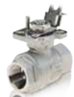
Type 2651 Standard