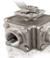
Type 2651 Multi-Port