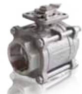
Type 2654 Standard