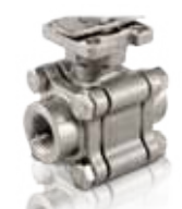
Type 2654 High Pressure