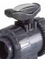
Type 2657 standard