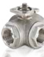
Type 2651 3-Way