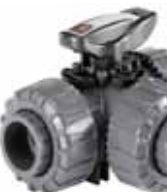
Type 2657 3-way