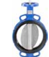
Type 2671 Butterfly Valves