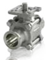
Type 2654 Clamp