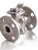
Type 2651 Flange