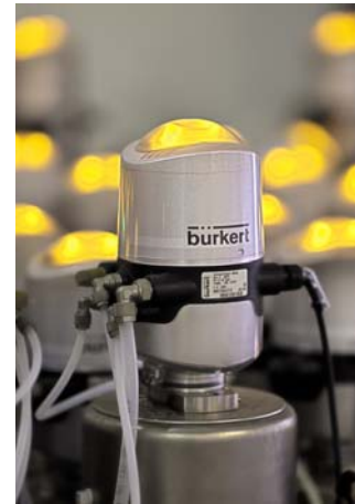
Universally adaptable control head for hygienic processes

Each process valve is connected directly to the main compressed air supply line in the field, reducing the number and length of tube and cable connections, as well as the number of required control cabinets to a minimum. The ELEMENT range of process valves are themselves designed according to the guidelines for hygienic design and easy cleaning: they feature the high IP protection required by the actual application, and are made exclusively of detergent-proof materials. As a result, they are not affected by prolonged use in environments with high levels of humidity, or by frequent cleaning cycles with aggressive chemicals.