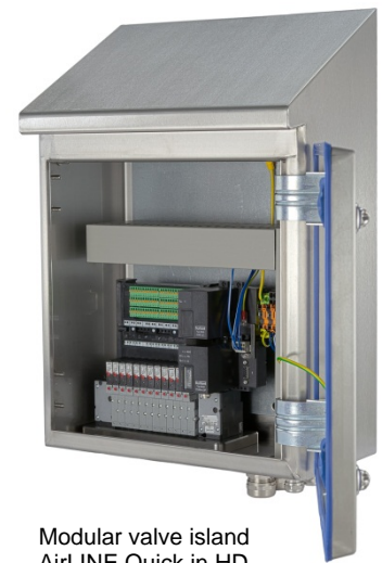
Modular valve island AirLINE Quick in HD switching cabinet

With AirLINE Quick, all pneumatic connections, the Fieldbus interface and the I/O modules can be mounted directly on the control cabinet base or side. This facility allows for an altogether smaller design of control cabinets. Additional components such as pipes, cables or control cabinet connections are eliminated, due to direct mounting, further reducing the time needed for installation and commissioning.