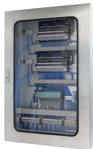
Classic control cabinet with valve terminal and automation system in a centralized solution

According to HACCP, every additional control air and feedback line within the production plant is a potential source of contamination and risk, and must therefore be monitored, serviced and cleaned regularly, which is a costly undertaking.