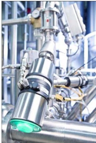
Control head ELEMENT for decentral automation of process valves